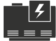
Small Power Generators